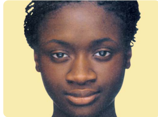
representative 05 TV :15

WOMAN: alta.com searches more of the Web than anyone else. And we never return with advertisers at the front of the list because they paid to be there. Your search isn't biased. Why should ours be?