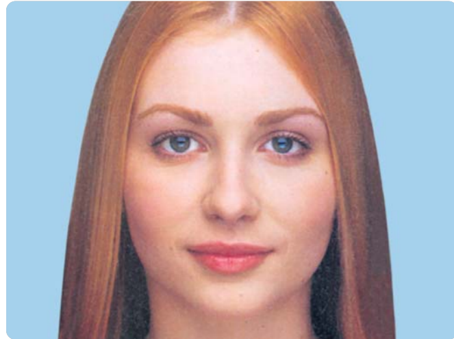
representative 01 TV :30

WOMAN: I am here to invite you to visit alta.com . We are more than a search engine. We are more than a shopping service. We are a place with quantifiable differences: faster, smarter, more powerful. And it is our belief that the best way to get you relevant information is to communicate in a candid and straightforward manner. It seems to make a lot more sense than trying to dazzle or trick you. After all, we'd be found out as soon as you logged on.