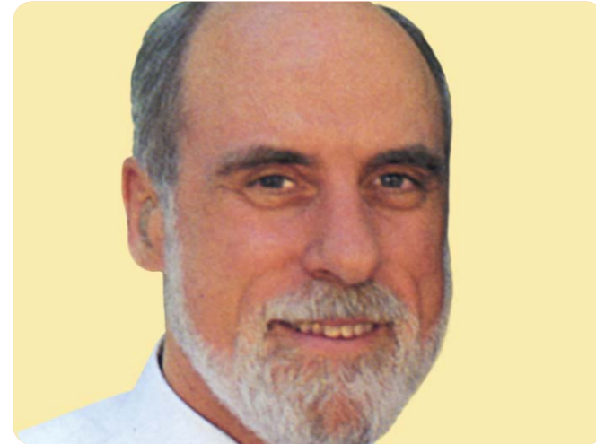
representative 03 TV :10