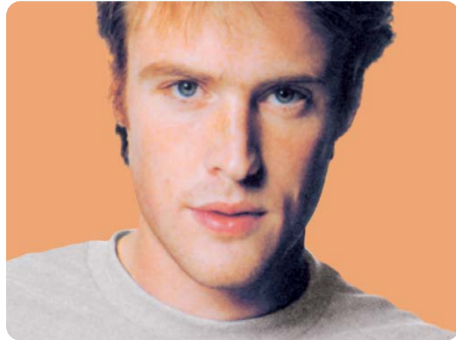
representative 04 TV :15

MAN: The search time on alta.com is on average, half a second. Which means your precious time can be spent elsewhere.